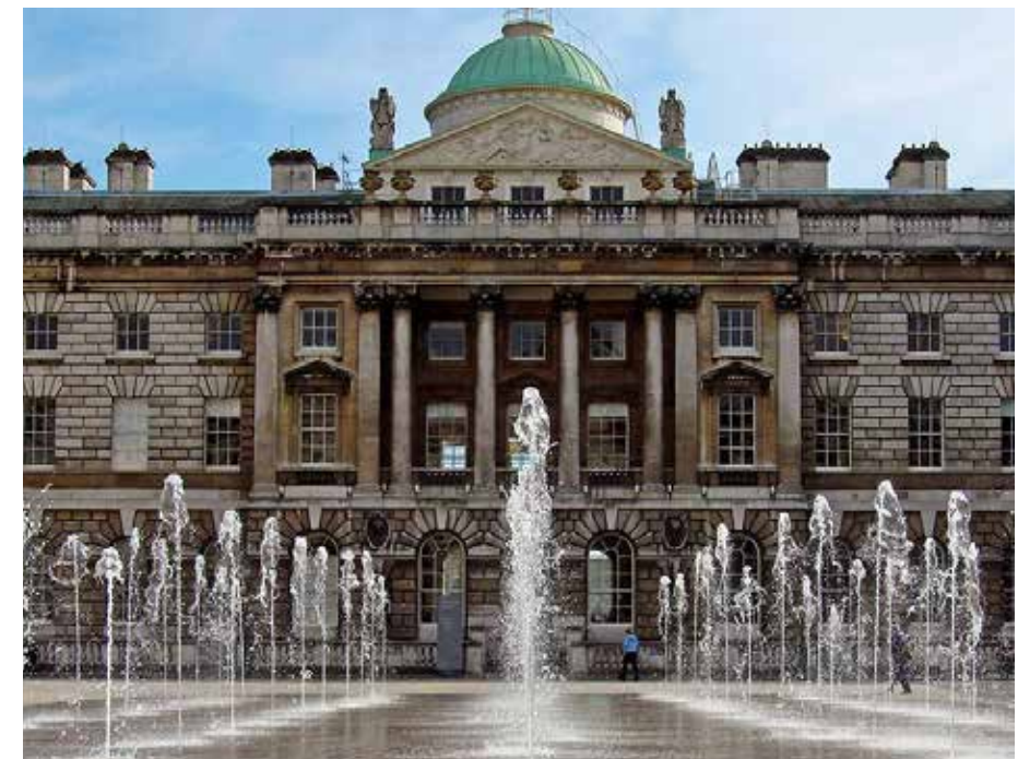
Somerset House, London