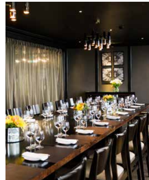
City Social, London

All our venues deliver first class service, cutting-edge facilities and tailor-made events enabling you to make the right impression with your guests.