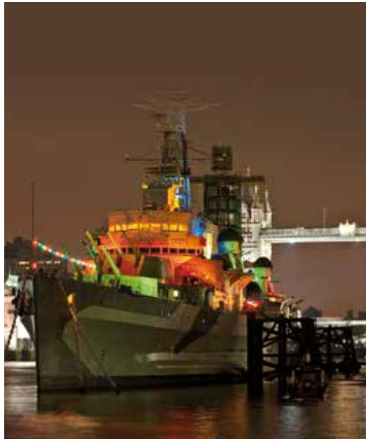
HMS Belfast, London