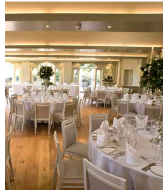
Hever Castle, Kent