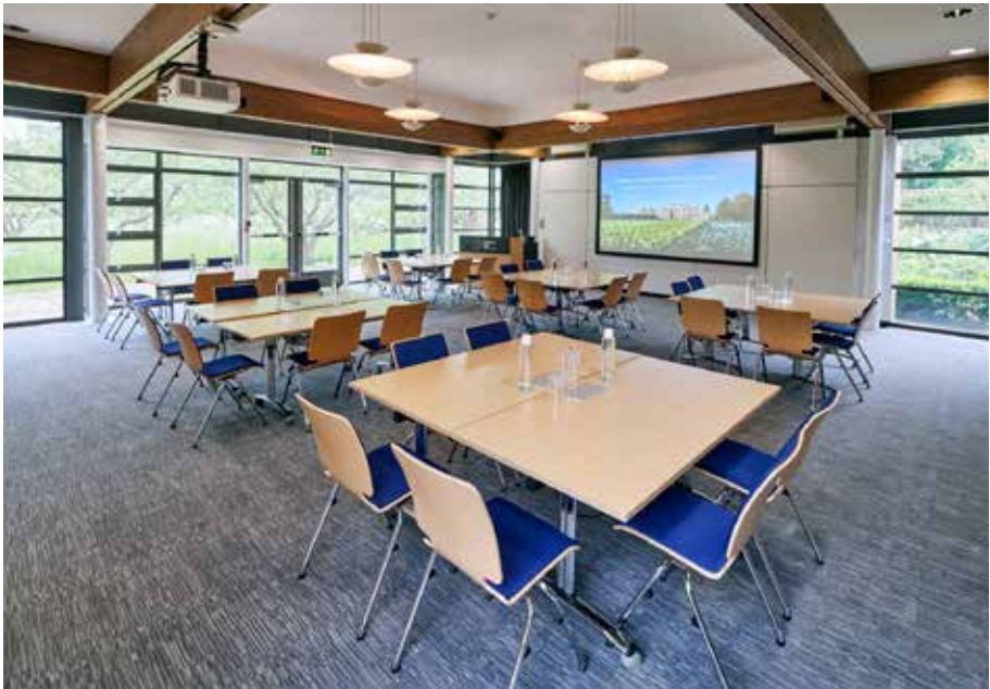
Hinxton Hall, Cambridge