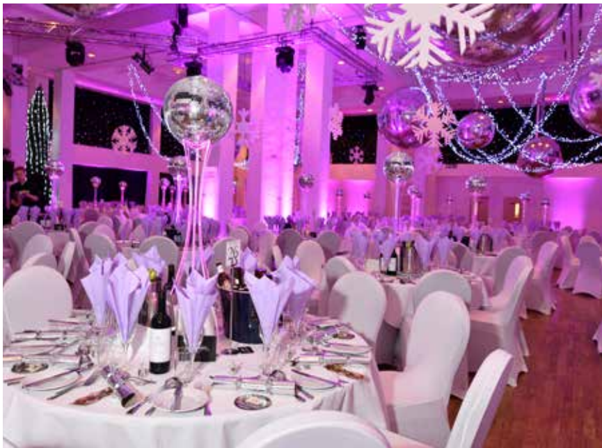
Royal Armouries Museum, Leeds