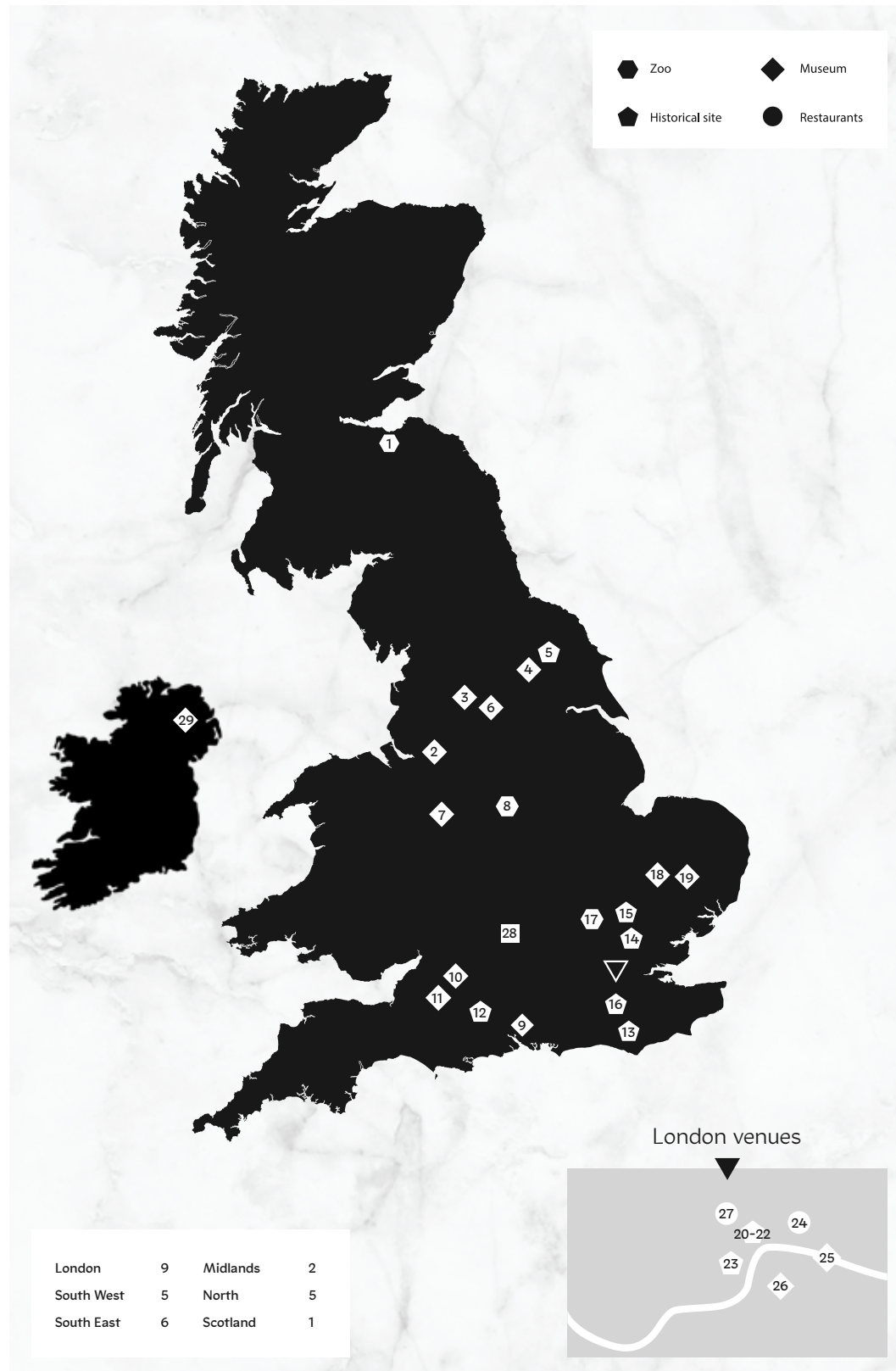
Venue Locations &amp; Capacities