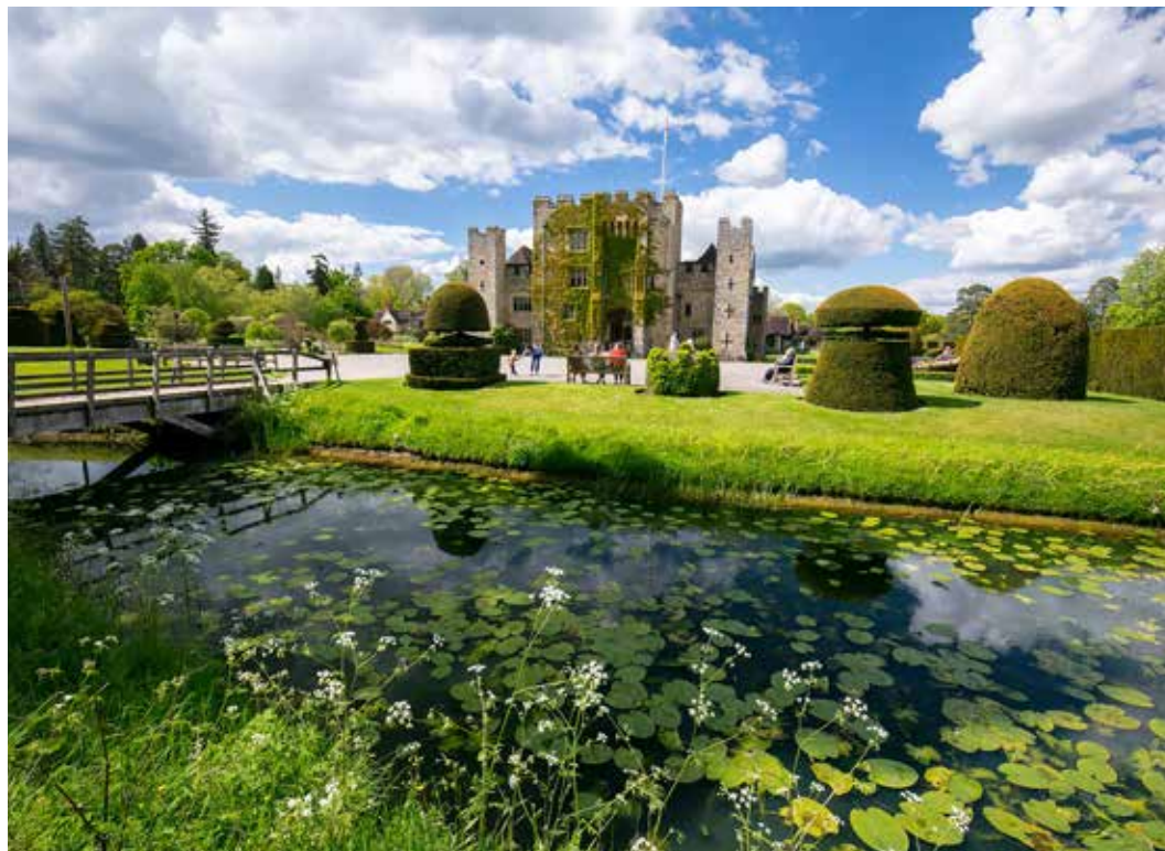
Hever Castle, Kent