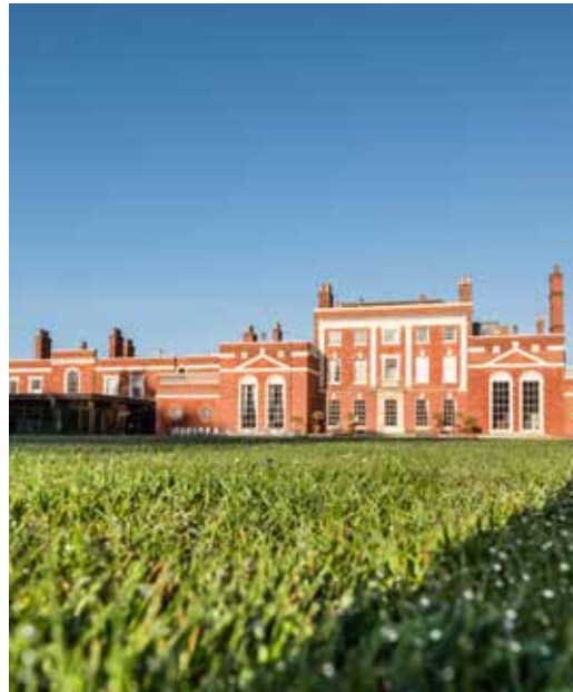
Hinxton Hall, Cambridge