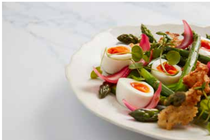
Food, glorious food

Our bottled and canned water is Life, who fund clean water projects across the globe, through every drink sold