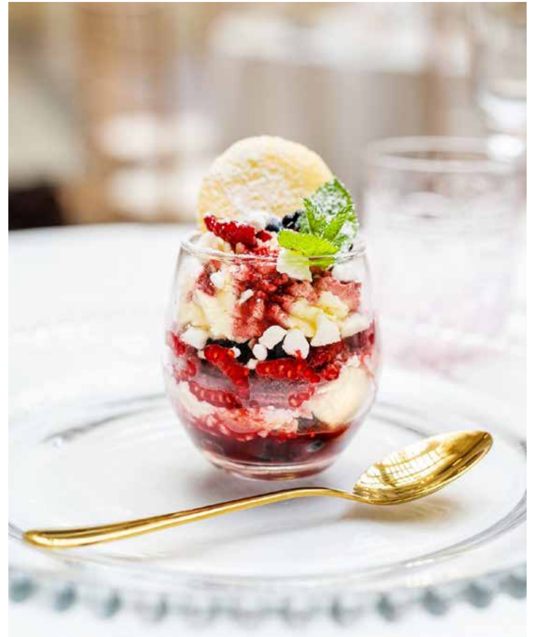
Bristol Museum & Art Gallery