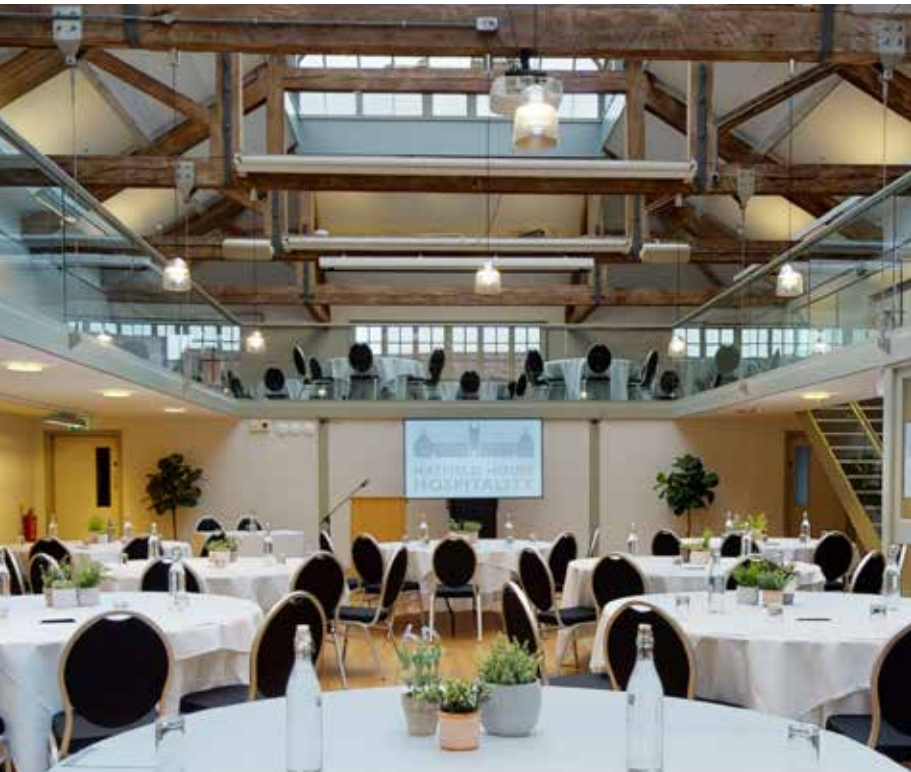
Hatfield House, Hertfordshire