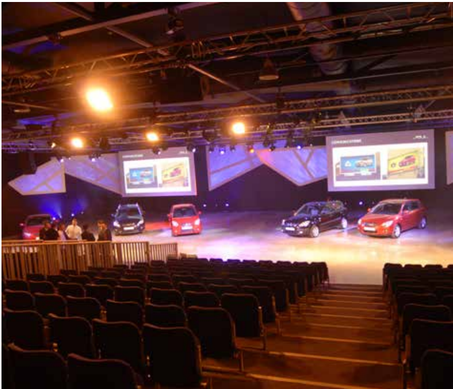
Royal Armouries Museum, Leeds

We have a wide variety of venues suitable for all event requirements. From lecture theatres, intimate meeting rooms at an idyllic castle, team building activity days in the countryside to private dining rooms overlooking the City of London. We know how important it is to create an unforgettable experience for your guests, and we would be delighted to support you in creating a tailor-made event.