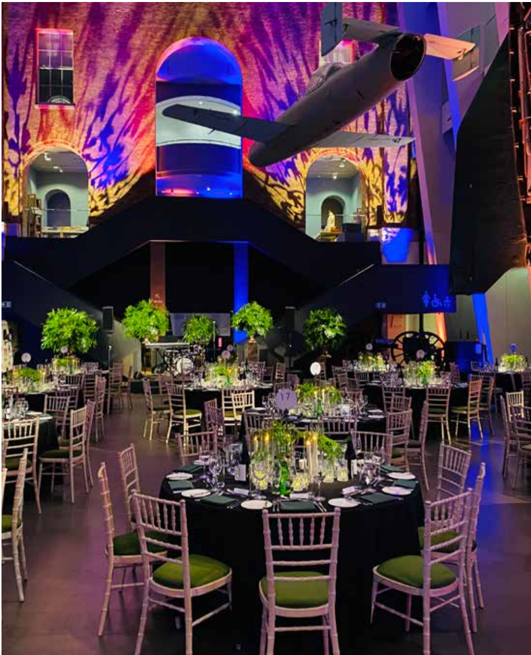
IWM London, London