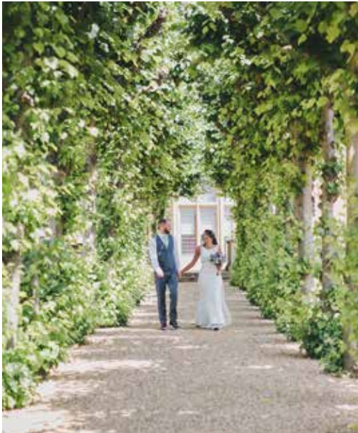
Knebworth House & Barns, Hertfordshire