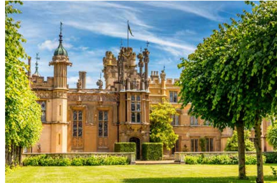
Knebworth House & Barns, Hertfordshire

We believe our care and creativity helps spark innovation, connection and community, whether we are putting on a special event, arranging a banquet or leading hands-on cooking classes.