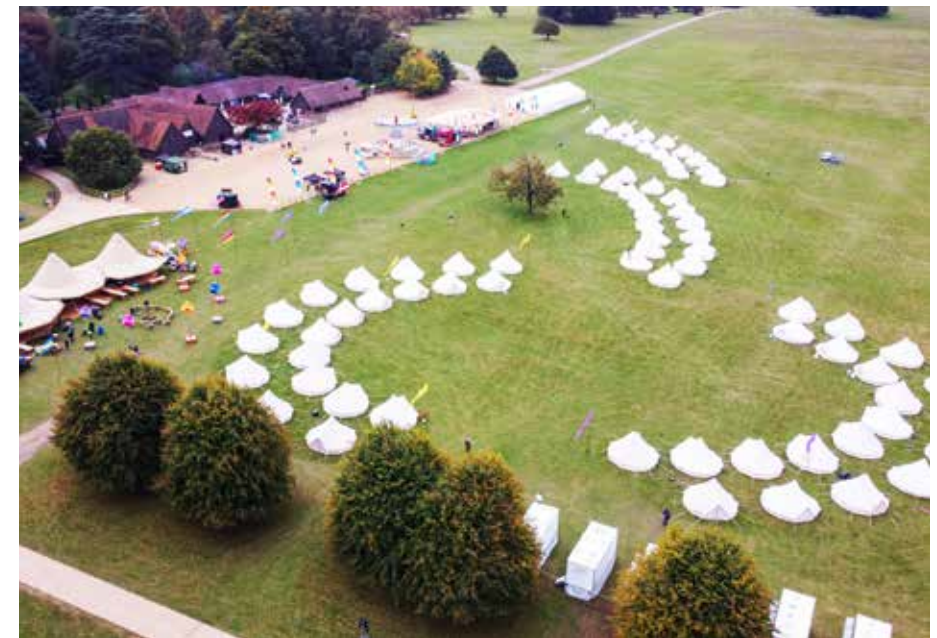
Knebworth House & Barns, Hertfordshire