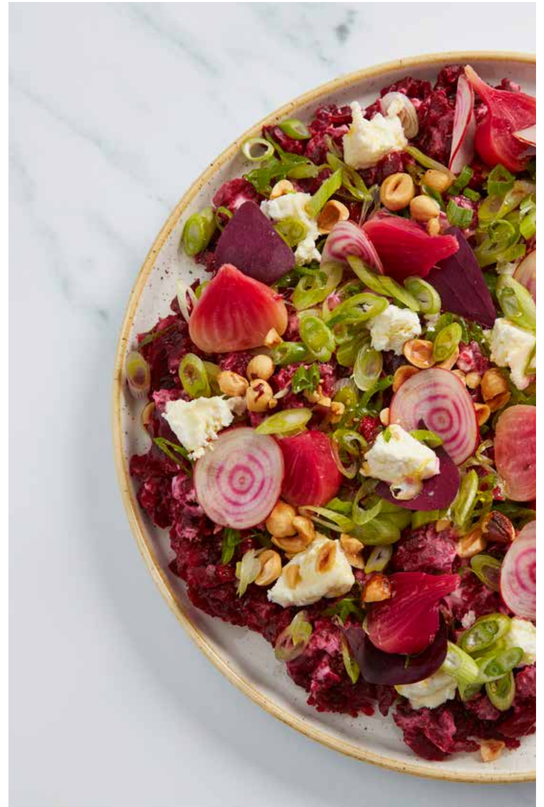
Food, glorious food