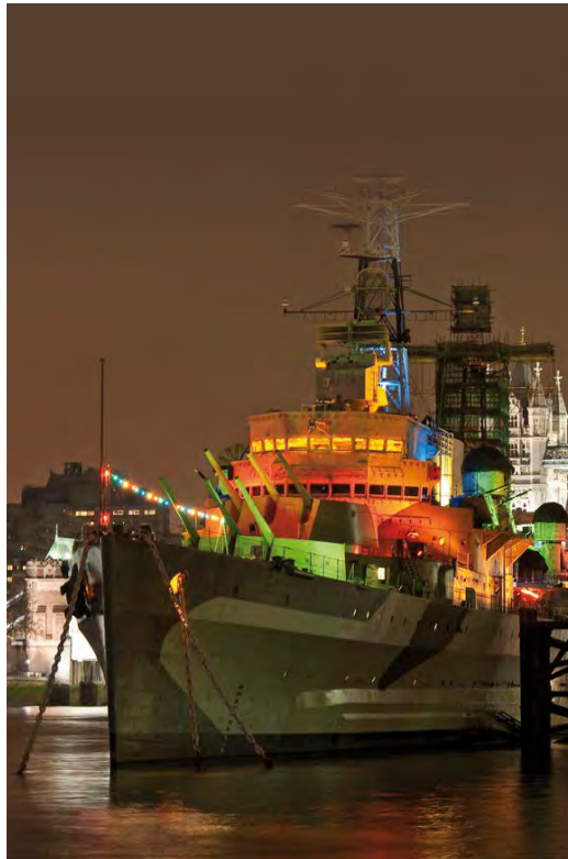
HMS Belfast, London