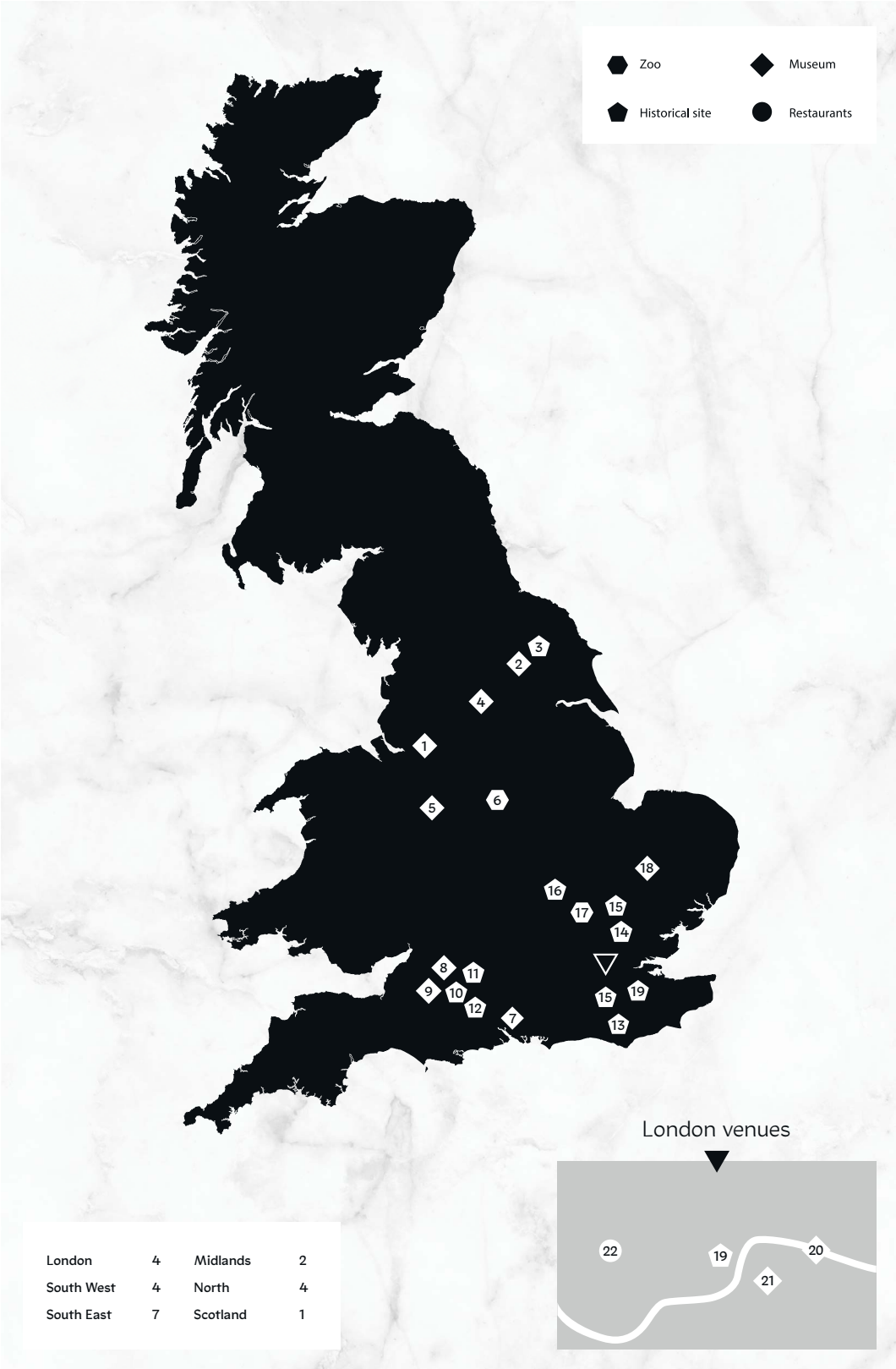
Venue Locations & Capacities