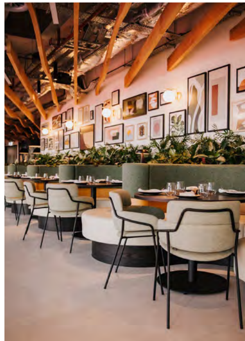
Unity Sky Lounge, Milton Keynes