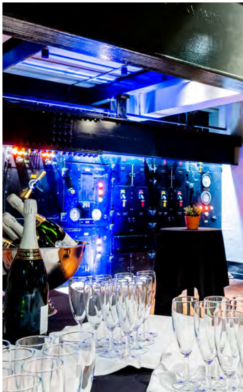
Churchill War Rooms, London