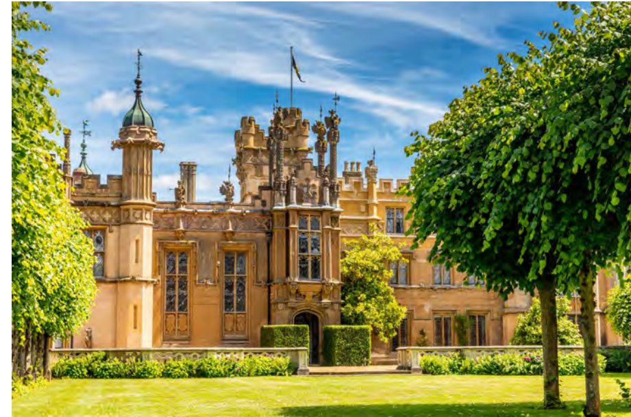
Knebworth House & Barns, Hertfordshire

We believe our care and creativity helps spark innovation, connection and community, whether we are putting on a special event, arranging a banquet or leading hands-on cooking classes.