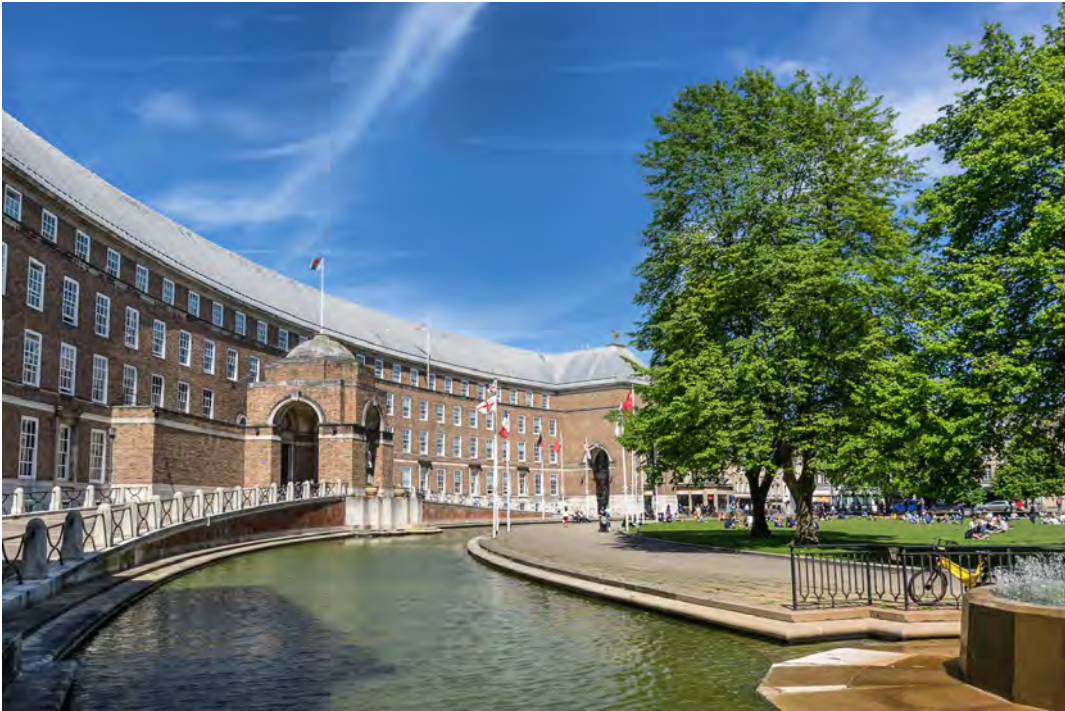
Bristol City Hall