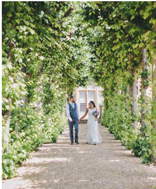
Knebworth House & Barns, Hertfordshire