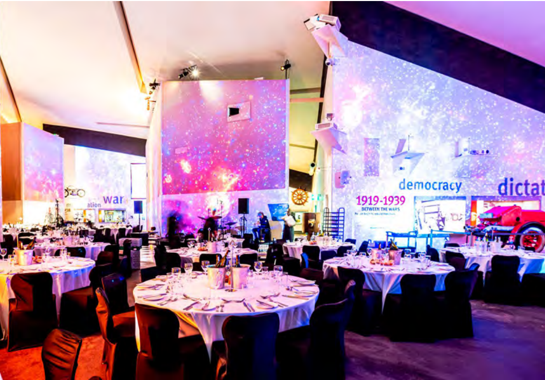
Imperial War Museum North, Manchester