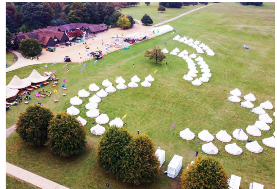
Knebworth House & Barns, Hertfordshire