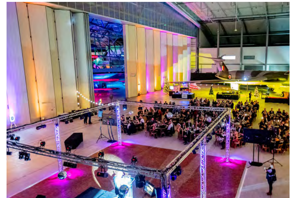
Imperial War Museum, Duxford