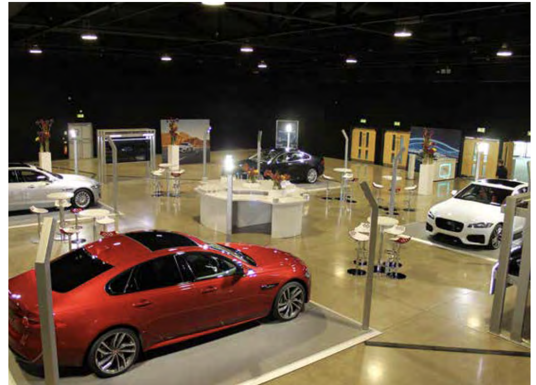
Royal Armouries Museum, Leeds