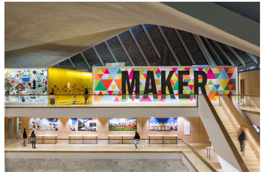
the Design Museum, London