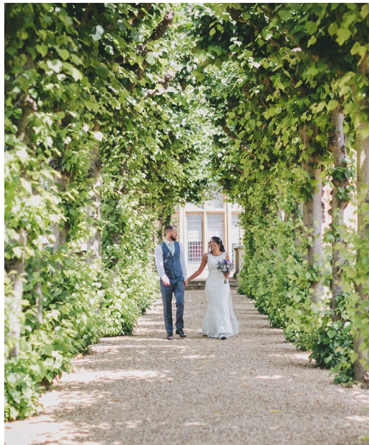
Knebworth House & Barns, Hertfordshire