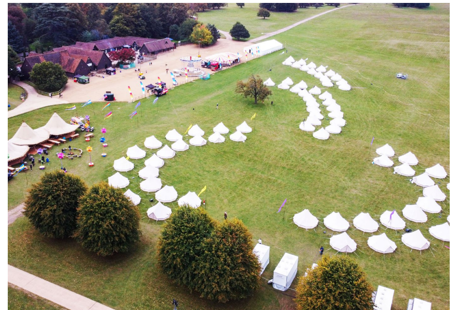
Knebworth House & Barns, Hertfordshire