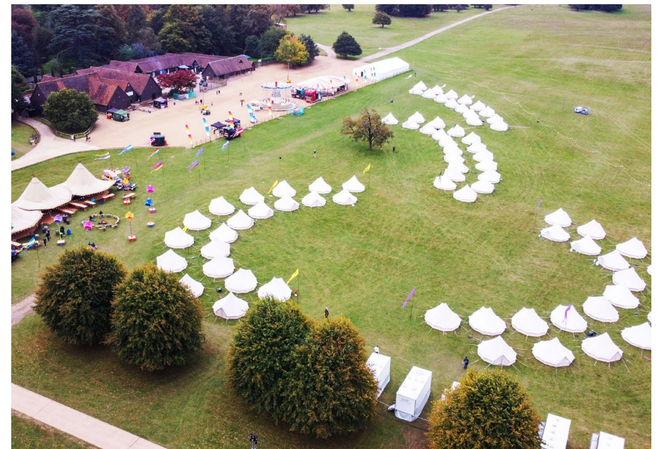
Knebworth House & Barns, Hertfordshire