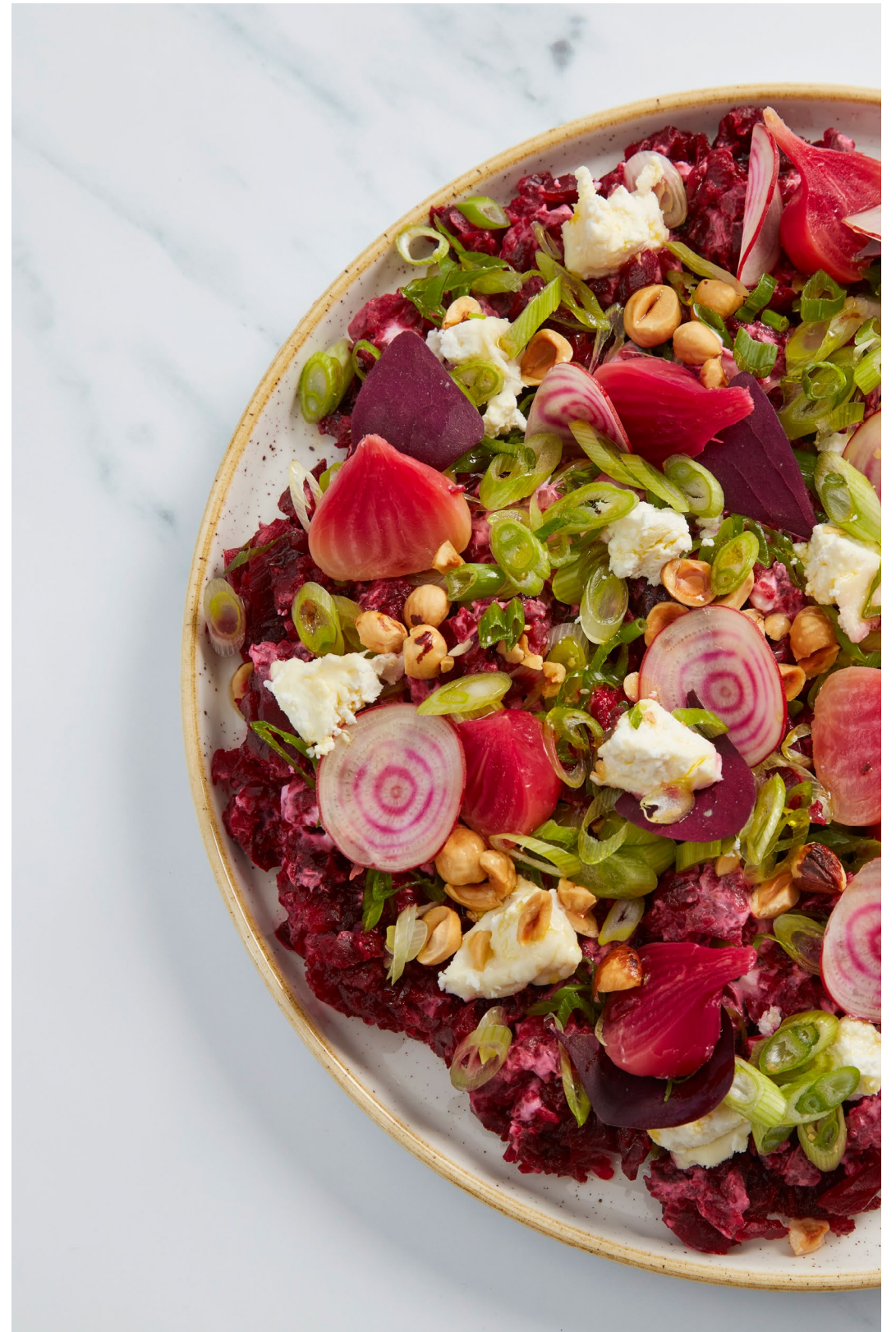
Food, glorious food