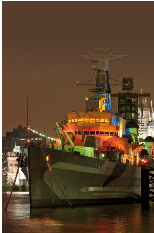
HMS Belfast, London