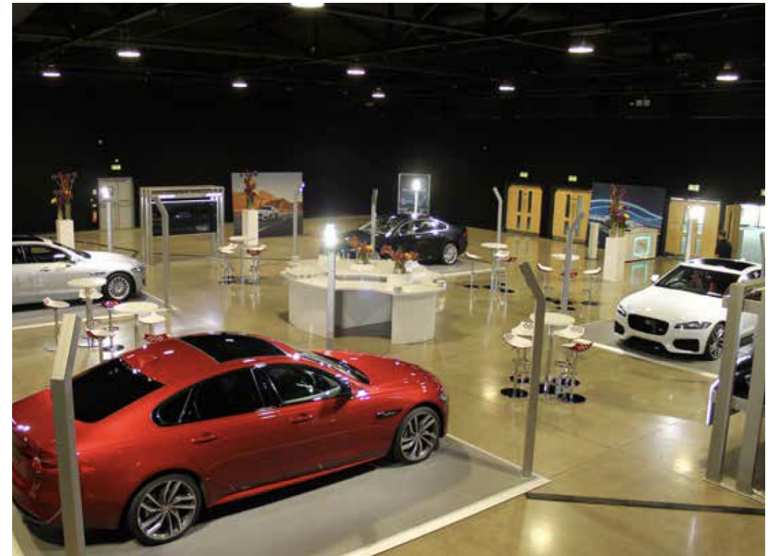
Royal Armouries Museum, Leeds