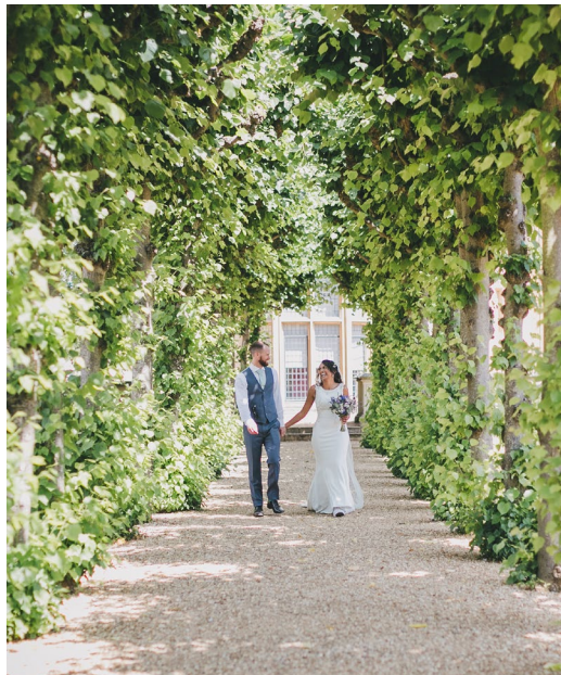
Knebworth House & Barns, Hertfordshire