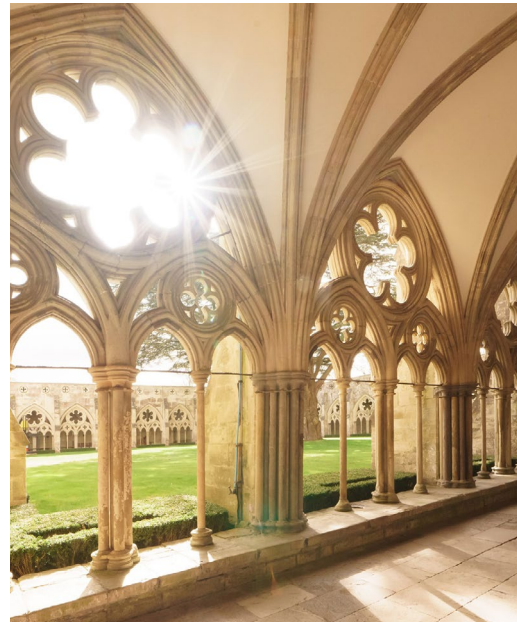
Salisbury Cathedral, Salisbury