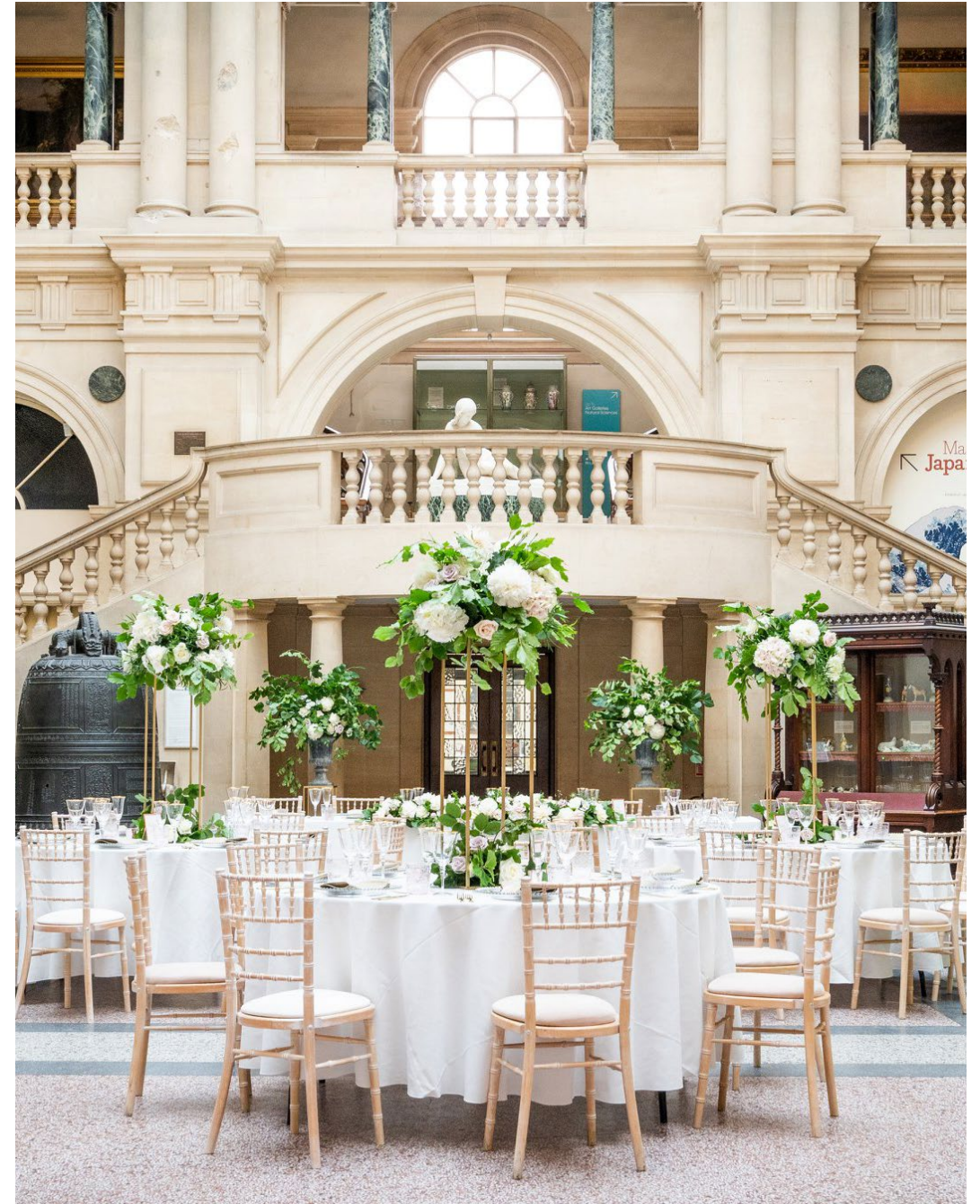
Bristol Museum & Art Gallery