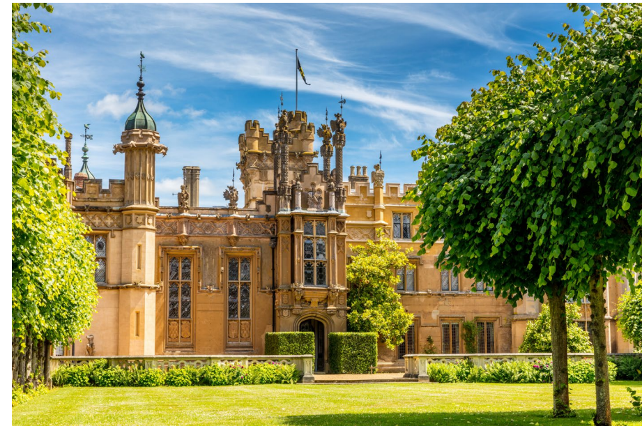
Knebworth House & Barns, Hertfordshire

We believe our care and creativity helps spark innovation, connection and community, whether we are putting on a special event, arranging a banquet or leading hands-on cooking classes.