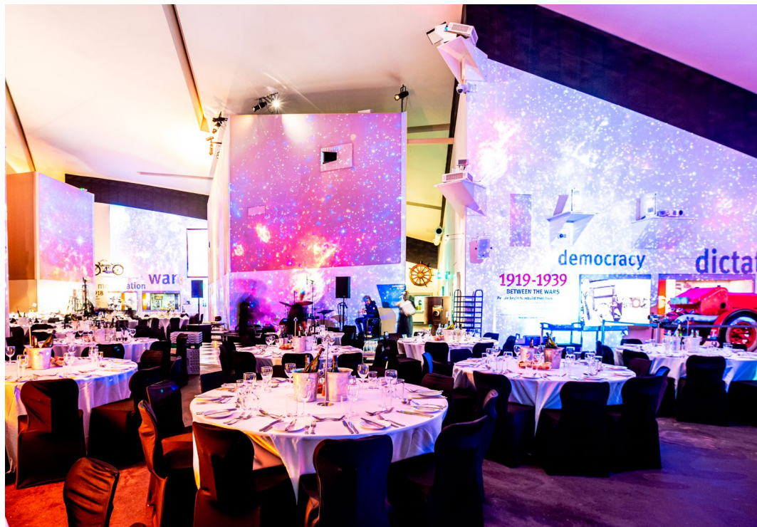
Imperial War Museum North, Manchester