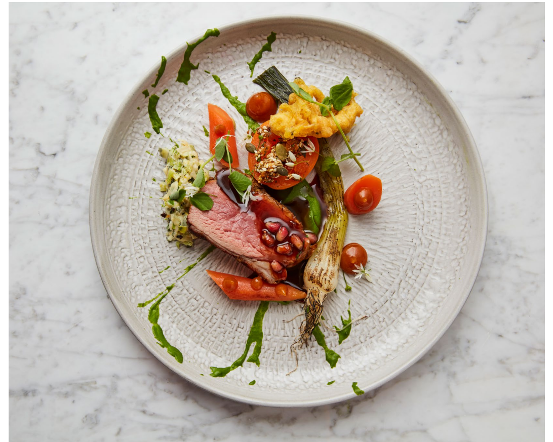
Food, glorious food

We challenge our teams to be creative and allow them space to play, to create menus that delight our guests. For us, it is always about challenging the norm and never settling for second best; working with unapologetic foodies whose energy and desire to be the best matches our own.