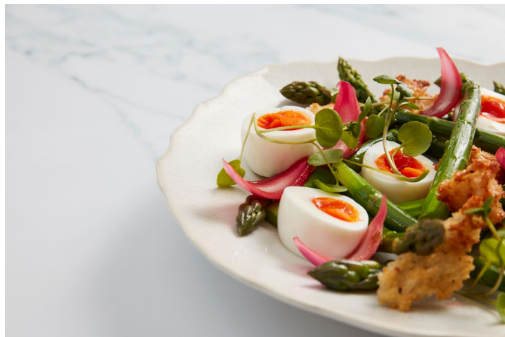
Food, glorious food

Our bottled and canned water is Life, who fund clean water projects across the globe, through every drink sold