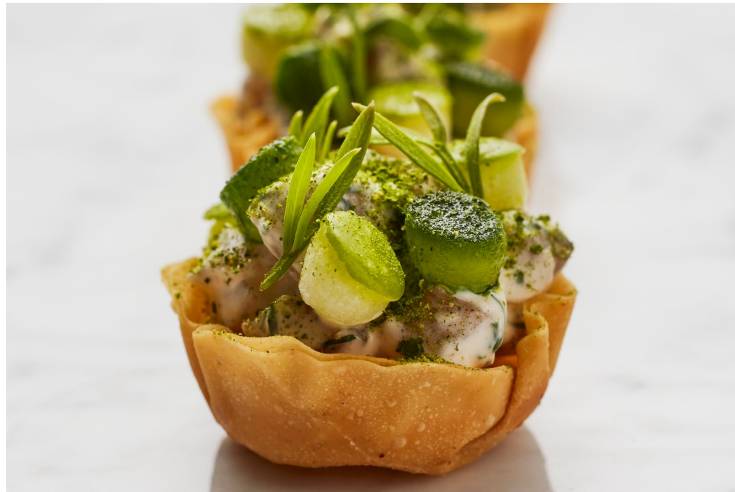
Food, glorious food