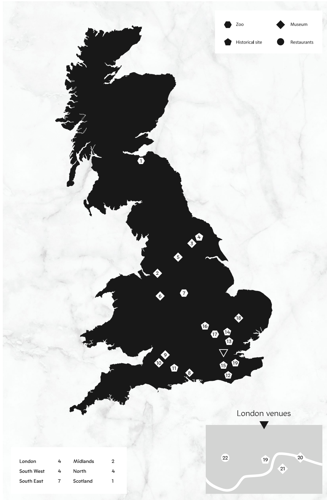
Venue Locations & Capacities