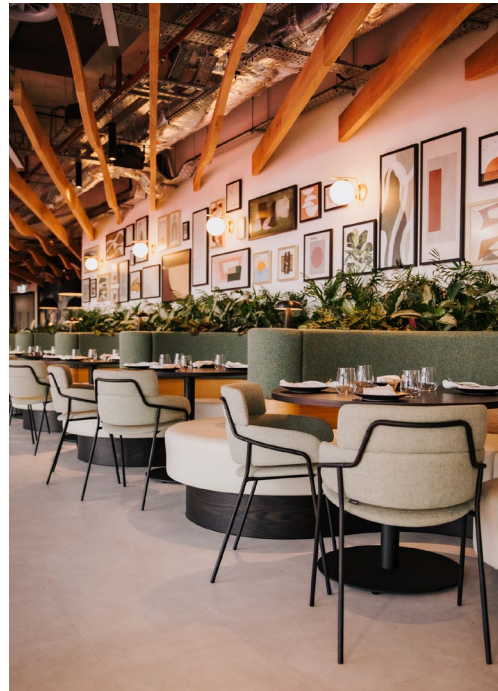
Unity Sky Lounge, Milton Keynes