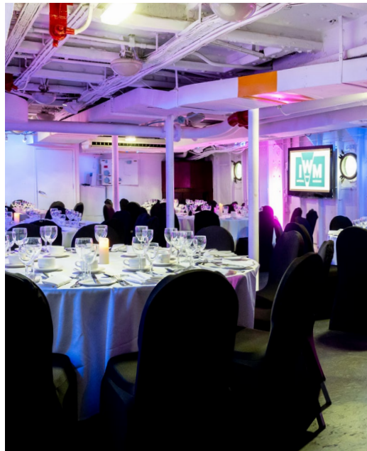
HMS Belfast, London